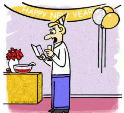
Honey, our lawyer wishes us, but in no way guarantees, a Happy New Year.