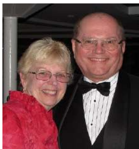
By Ginny and Jeff Schuett

A good defender must know the difference between active and passive defense. Often, once the opening lead is made and the dummy comes down, one or both defenders can take certain clues from that dummy as an indication of what approach to defending is indicated by that dummy.