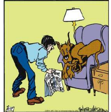
"Man's best friend wouldn't steal his favorite chair."

"I have no recollection of the last twenty-four hours," said Tom lackadaisically.